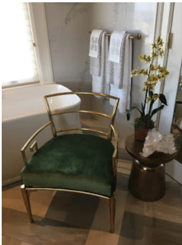
Accents in the Master Bathroom by Cecilie Starin

I also marveled at Cecilie's choice of very hip furnishings and artwork: